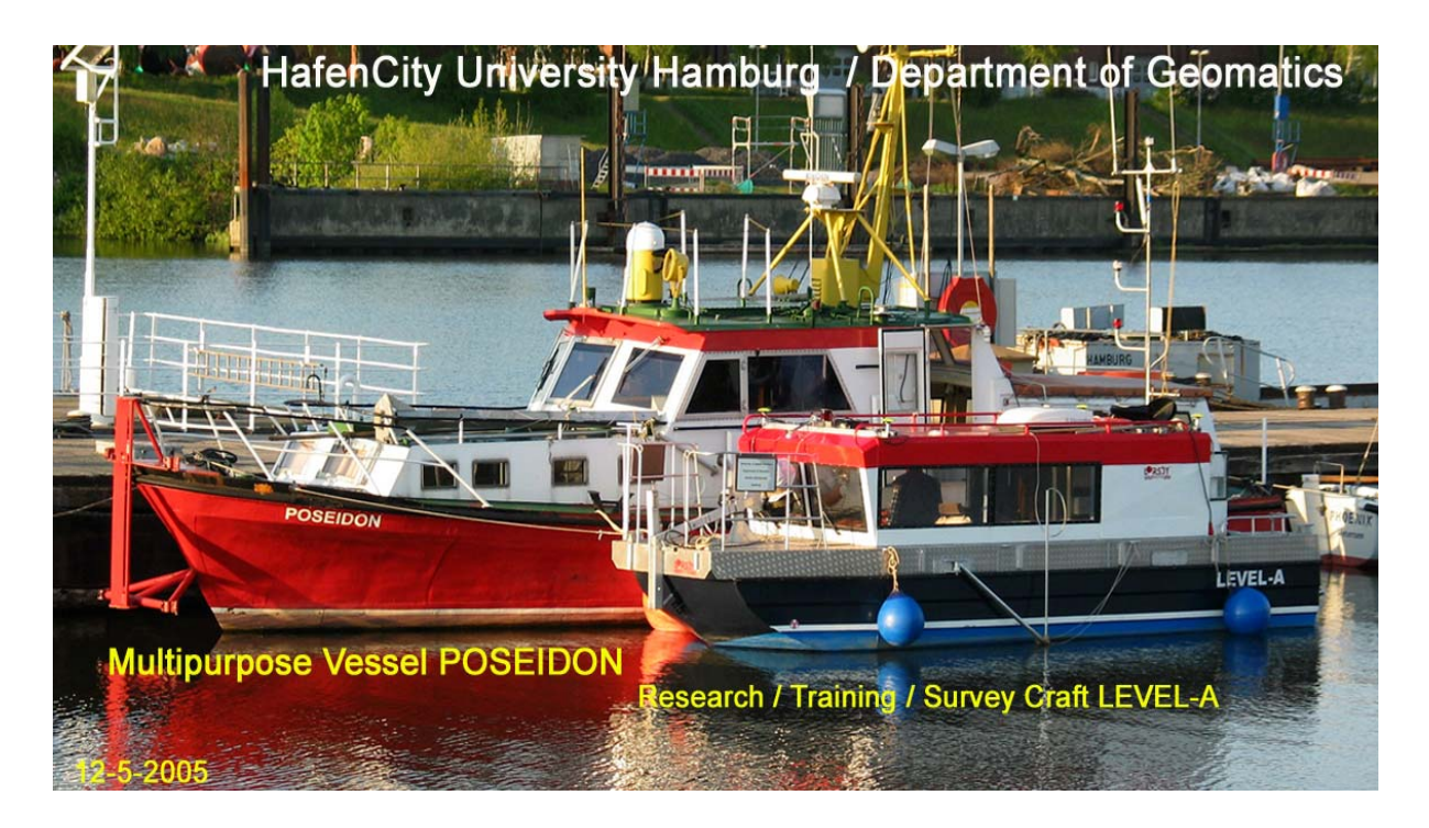
Fig. 2. HCU survey craft for training, research and special purposes

The data delivered by the IMSS components (GNSS-Javad-Gyro-4, Motion Sensor Octans III, IMU Inertial Measurement Unit) are integrated by the software GNNET-RTK developed by Geo++ GmbH, Garbsen.