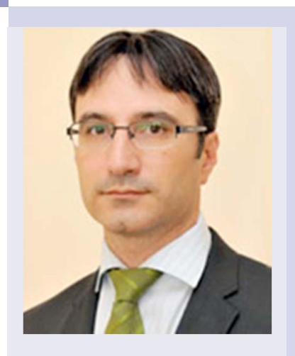
Traycho Traykov MINISTER OF ECONOMY, ENERGY AND TOURISM