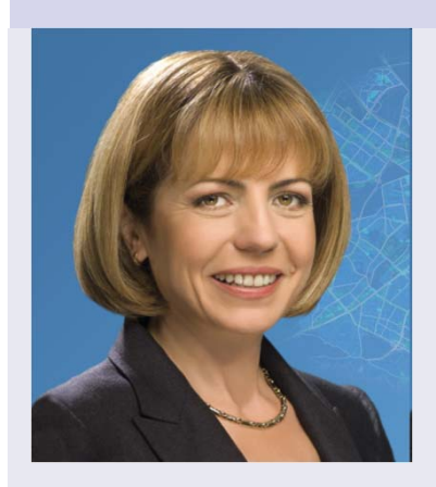
Yordanka Fandakova MAYOR OF SOFIA MUNICIPALITY