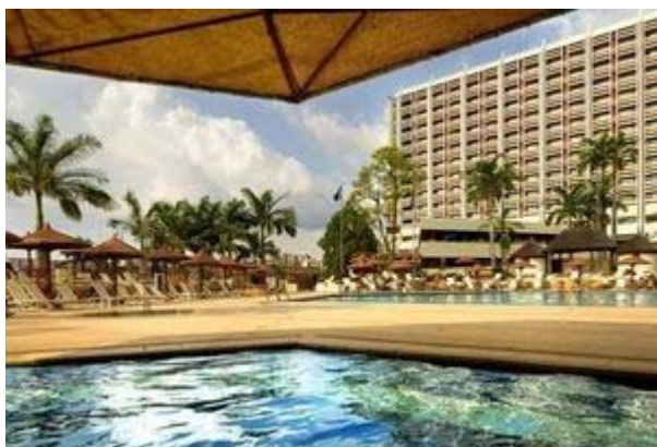
Relaxation site at Transcorp Hilton Hotel

Hotel services include e.g.: recreational facilities, business centre, Club Lounge and 2 Executive floors, Conference/Meeting/Exhibition and Banqueting facilities, Medical Clinic and Dentist, Free Parking, Internet facilities, Simultaneous translation, Handy craft Village, Mini-zoo and Casino.