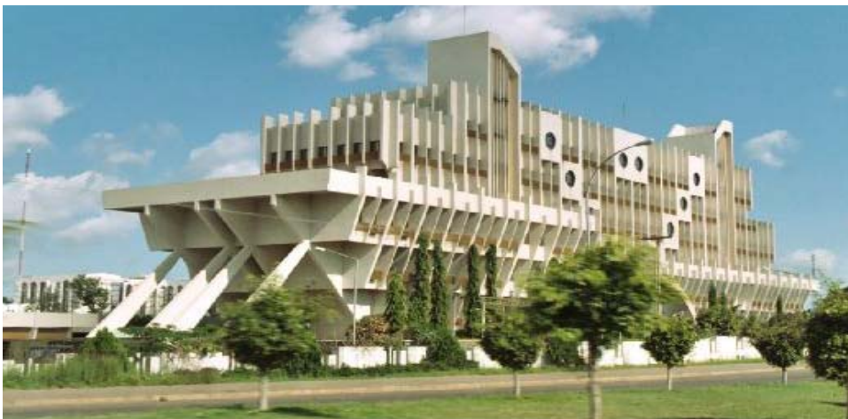
National Defence Headquarters