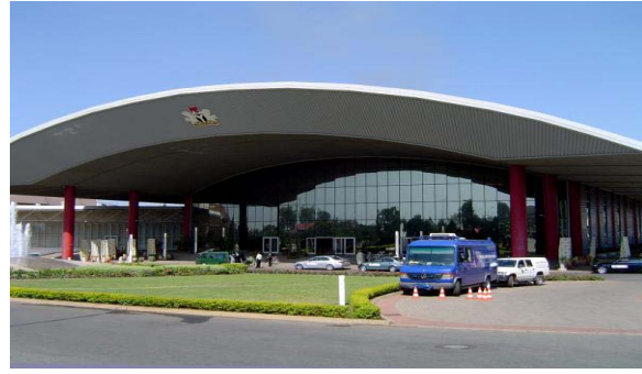
INTERNATIONAL CONFERENCE CENTRE