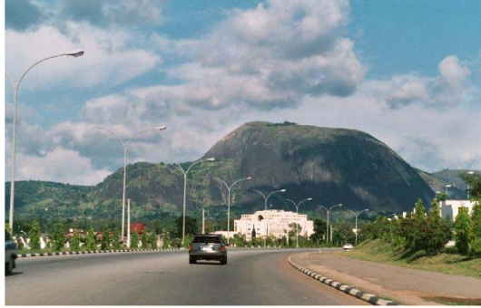
ABUJA ZUMA ROCK