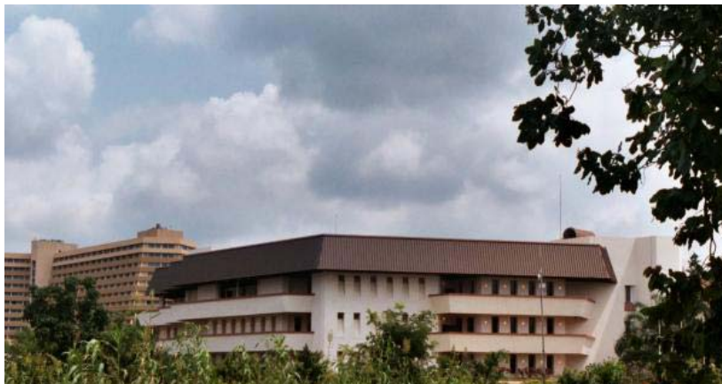
International Conference Center

We are proposing the opening ceremony will take place at the Abuja International Conference Center . Abuja International Conference Center is a magnificent edifice overlooking the Radio House lying in its own lovely garden filled with historic shady pine trees and well paved drive way. It is locate in the city center, close to Le Meridien Hotel adjacent to the ECOWAS PARLIAMENT. This Conference Center had hosted Commonwealth Head of States Africa Union Head of States and the visit President Bill Clinton etc.