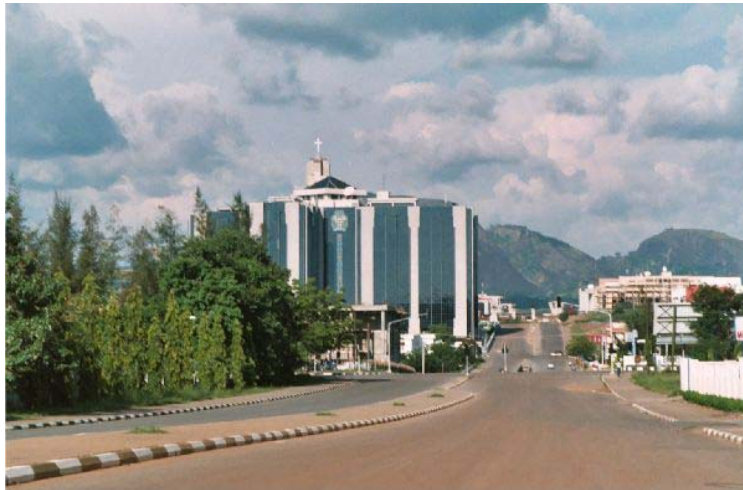
CENTRAL BANK OF NIGERIA

The city has been well planned and the Central District is located between the foot of Aso Rock and the Three Arms Zone to the southern base of the ring road. It is like the city's spinal cord, dividing it into the northern sector with Maitama and Wuse, and the southern sector with Garki and Asokoro. While each district has its own clearly demarcated commercial and residential areas, the Central District is the city's principal Business Zone, where practically all parastatals and multinational corporations have their offices located. An attractive area in the Central District is the region known as the Three Arms Zone, so called because it houses the administrative offices of the executive, legislative and judicial arms of the Federal Government. A few of the other sites worth seeing in the area are the Federal Secretariats alongside Shehu Shagari way, Aso Hill, the Abuja Plant Nursery, the Parade Square and the Tomb of the Unknown Soldier. The Brigade of Guards organizes a twenty-four hour watch at the spot and they have a colorful ceremonial change of guard. The National Mosque and National Ecumenical Church are located opposite each other on Independence Avenue.