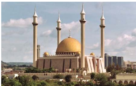
Nigerian National Mosque

The crescent shape of the city reflects the infrastructural considerations and the topography of the site. Abuja is located at 9°10'N 7°10'E. Most countries moved their embassies to Abuja and maintain their former embassies as consulates in the commercial capital of Nigeria, Lagos. Abuja's feature is Aso Rock, a 400-metre monolith left by water erosion. The Presidential Complex, National Assembly complex, Supreme Court, hotels, museums, international conference center, good roads. "Aso" means "victorious" in the language of the (now displaced) Asokoro ("the people of victory"). Other sights include the Nigerian National Mosque and the National Ecumenical Centre cathedral. The city is served by the Nnamdi Azikiwe International Airport, while Zuma Rock lies nearby.