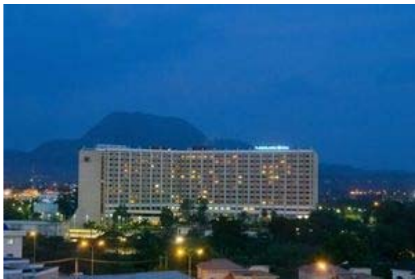
Night at Transcorp Hilton Hotel