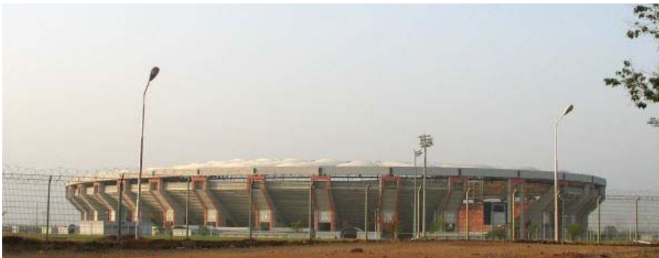
National Stadium, Abuja