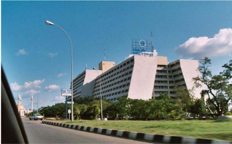
Sheraton Hotel, Abuja