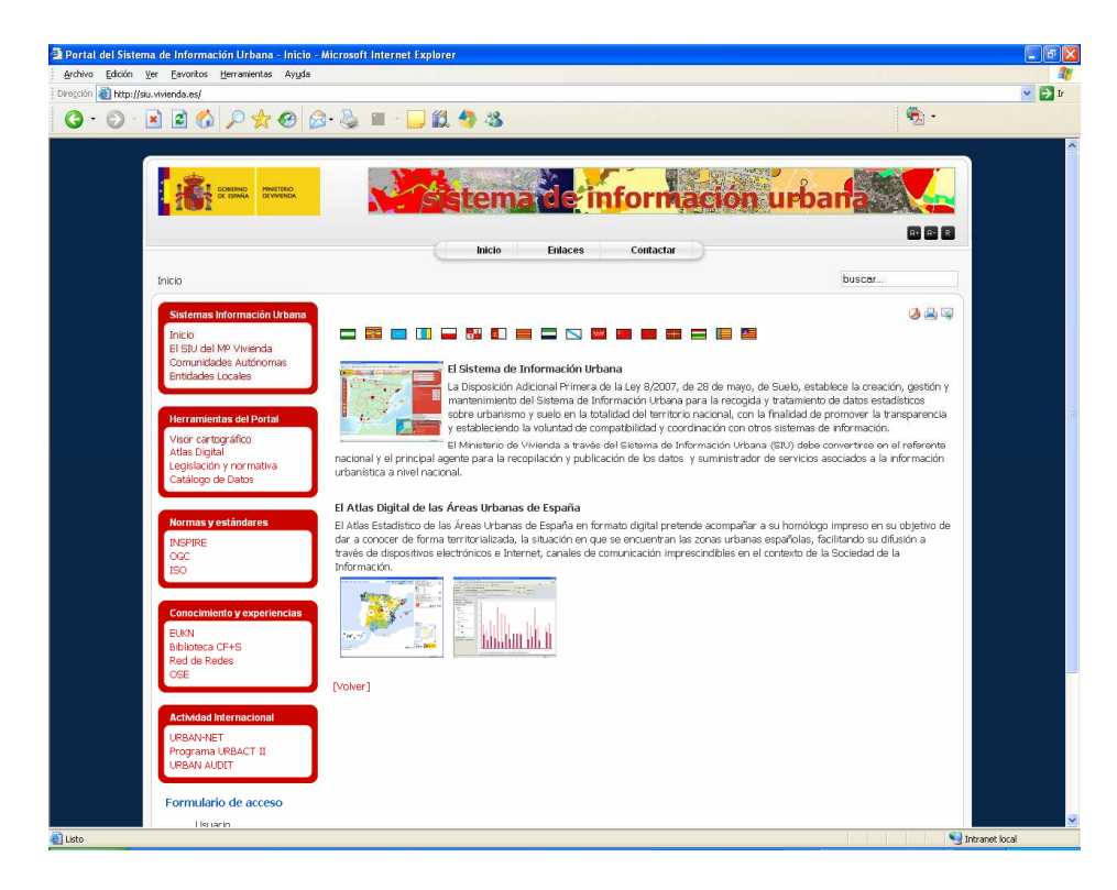
Figure 3. SIU Viewer