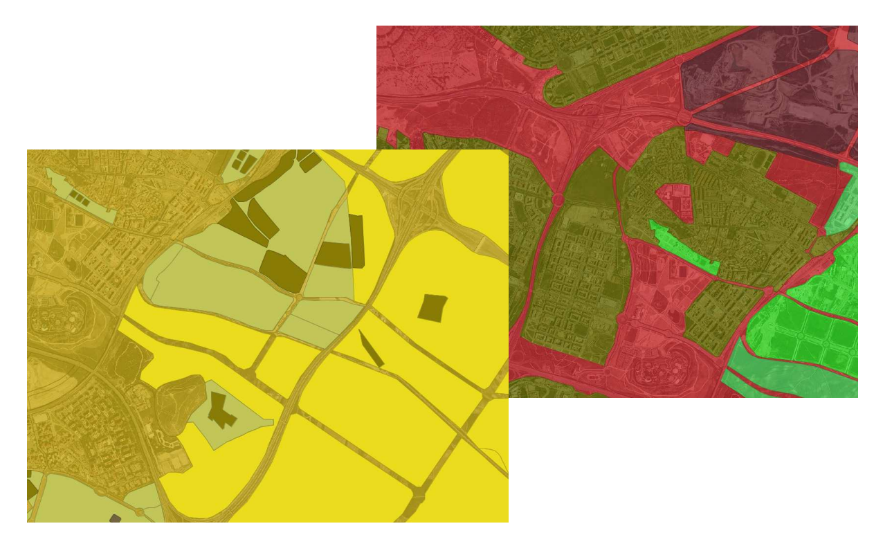
Figure 1. Classification and Developing Area Layer

The aim of the thematic subgroup is to homogenize the information of the regional departments and elaborate a common integrated model. Nowadays, it defines two layers: land classification and developing areas.