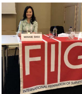
Chair of Women in Surveying Session