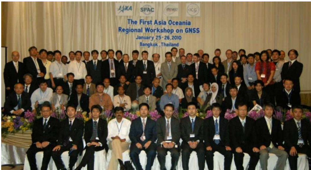
Figure 1: Workshop Attendees