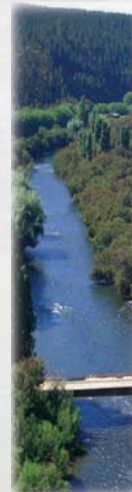
FIG VGCR VIETNAM ASSOCIATION OF GEODESY, CARTOGRAPHY AND REMOTE SENSING