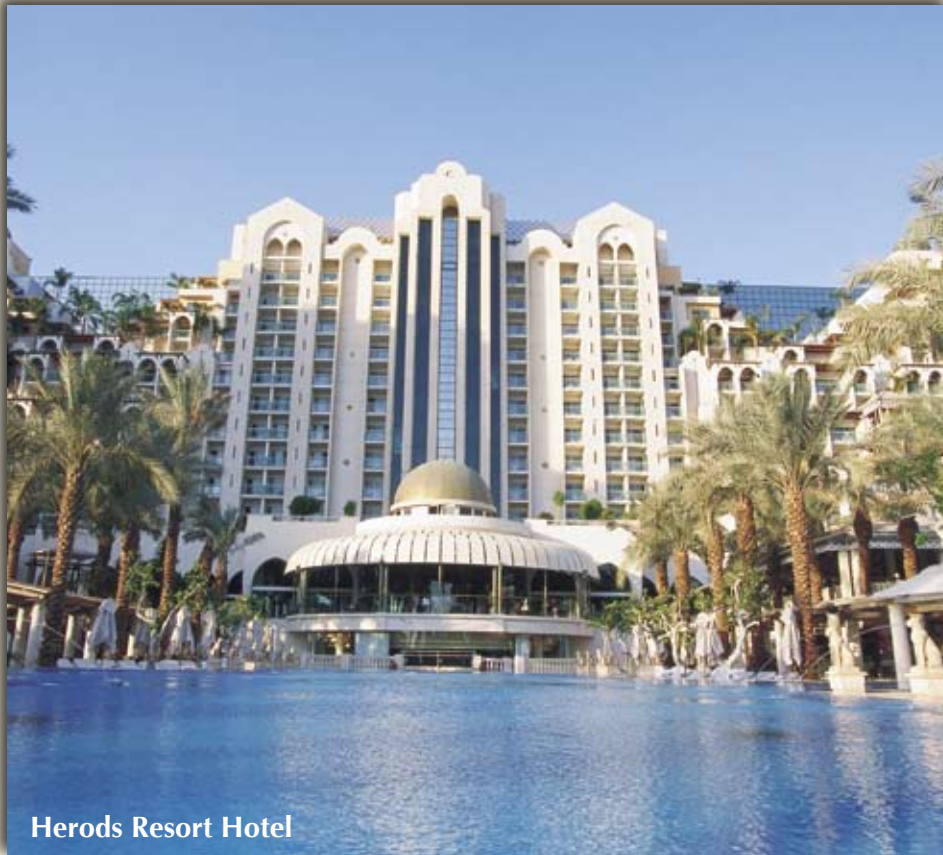
Herods Resort Hotel