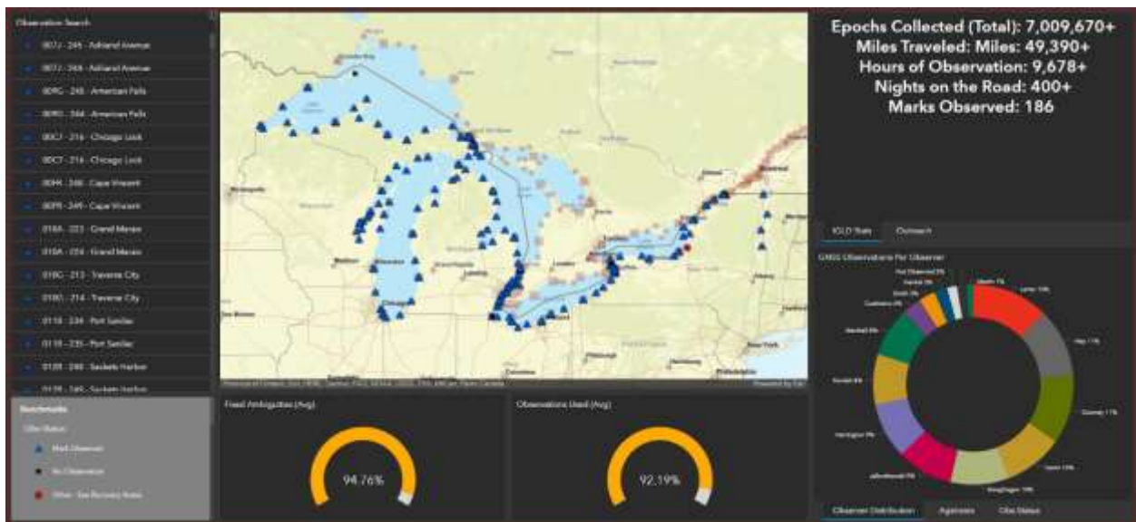
Figure 5: Post Survey ESRI Dashboard

After the survey campaign was completed, an ESRI dashboard was compiled by NGS for briefing interested stakeholders. This serves to be an effective way to quickly display the accomplishments by both nations when in meetings, conference sessions, and planning meetings in the future.