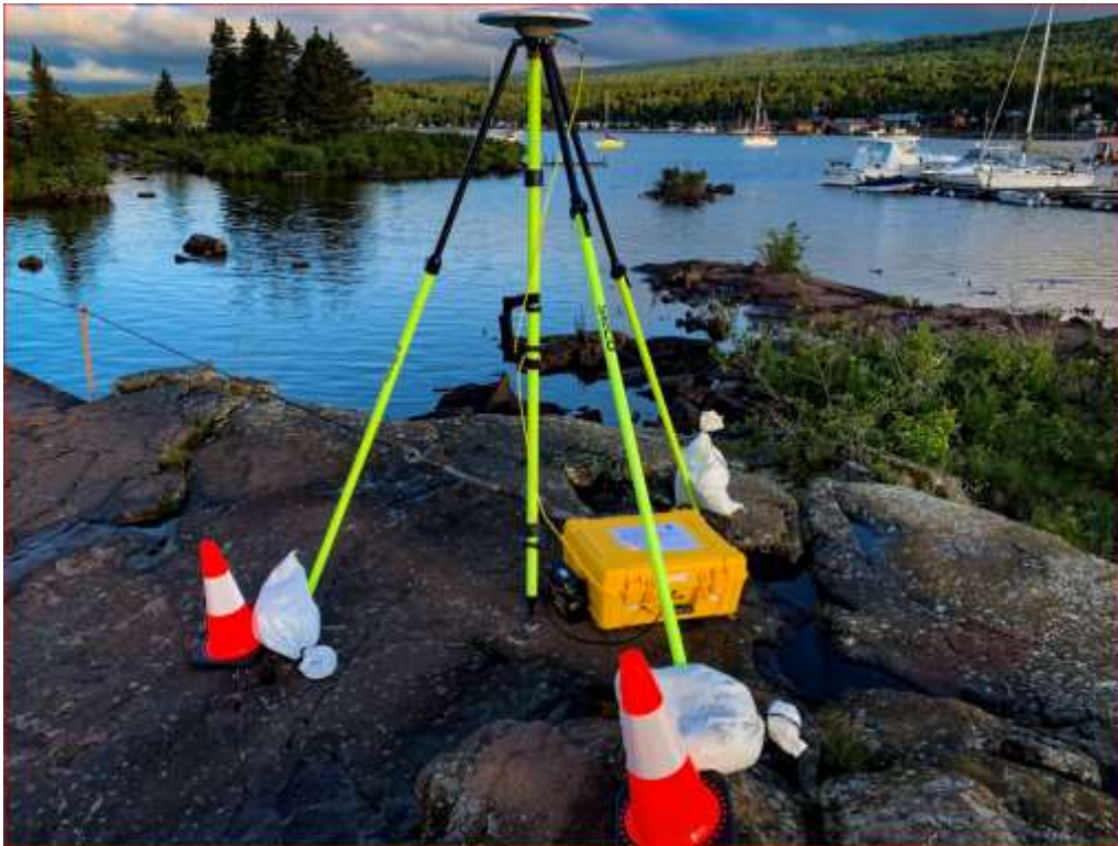
Figure 1: Photo taken at Grand Marie, Minnosota. Located on Lake Superior

Parallel with the site selection planning was an effort by team members to ensure the accuracies of the project were met through binational specifications for the GNSS survey campaign. These specifications detailed the requirements for bench mark selection, observation length, and sky visibility previously mentioned, but also served to lay out expectations for equipment preparation and the metadata to be collected. The latter items are critical for proper data collection and the ability to process it thoroughly with rigorous routines after the survey campaign. To maintain a high standard of quality of observations, geodetic-quality GNSS equipment was used by all partners for each observation. This high accuracy is achieved by ensuring receivers are dual frequency with a minimum of 10 channels