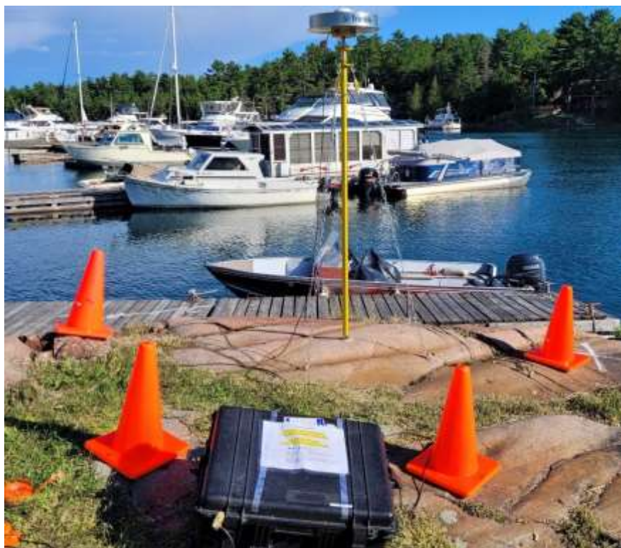
Figure 2: Photo taken at Killarney, Ontario. Located on Georgian Bay (Lake Huron)

Specific to the GNSS receivers, configuration parameters were advised to provide consistency between all agencies to maximize accuracy in the observations. A collection rate of 30 seconds was decided upon, along for 15 seconds if the receiver or observer required it. The 30 second rate ensured that ample epochs were collected without greatly increasing the size of the observation data file. Modern GNSS receivers are capable of extremely high collection