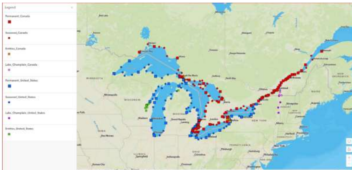
Figure 3: First Iteration planning map of permanent and seasonal gauge sites