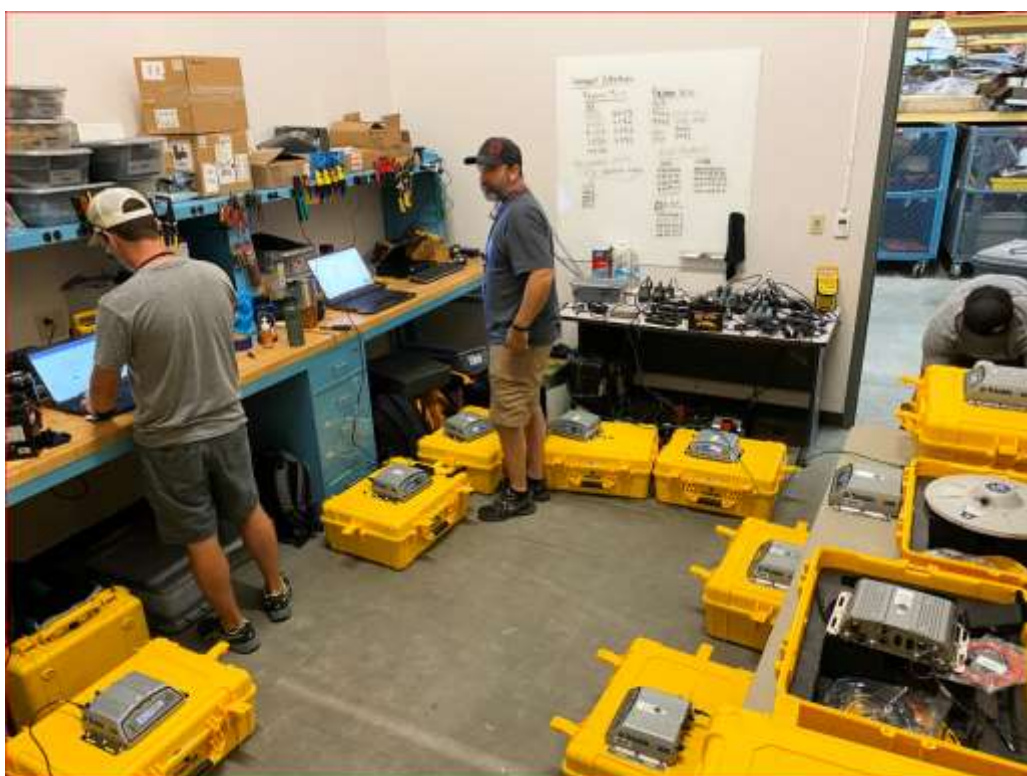
Figure 6: NGS personnel configure receivers prior to the IGLD 2020 campaign

With bench mark selection finalized, the exact dates for observations were determined with the goal of trying to keep "cross-lake" ties even between both nations. This scheduling would provide evenly spaced baselines roughly running north to south across the lakes in common. This created some challenges for carrying out the survey around Lake Michigan, as its many bench marks are all within the U.S. Other smaller complications were the far west end of Lake Superior, around Georgian Bay on Lake Huron, and then continuing north along the St. Lawrence River beyond the Moses-Saunders Hydroelectric Dam in Cornwall, Ontario where only Canadian gauges exist. This was accounted for by NGS starting a week earlier than Canadian agencies, splitting resources between the western end of Lake Superior (3 observers) and Lake Michigan (7 observers). CGS, CHS, and WSC began on August 9th, splitting their resources between the western end of The Great Lakes (8 observers) and the eastern end of The St Lawrence River near Rimouski, Québec and Tadoussac, Québec (5 observers).