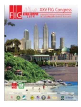
FIG Congress 2014 – Kuala Lumpur, Malaysia 16-21 June 2014 – Last Call for Submission of Abstracts

It is a pleasure to invite you to the XXV FIG Congress which will be held in Kuala Lumpur, Malaysia 16-21 June 2014. The Malaysian Local Organizing Committee and FIG are working closely together to organize a spectacular and outstanding event for you. The overall theme of the Congress is "Engaging the Challenges – Enhancing the Relevance", within the context of the FIG Work Plan for 2011 - 2014 that has a vision to extend the use and usefulness of the Profession for the betterment of society, environment and economy towards a world that we want.