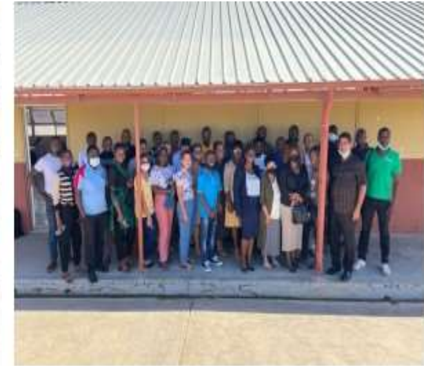
NSA awareness and training workshops