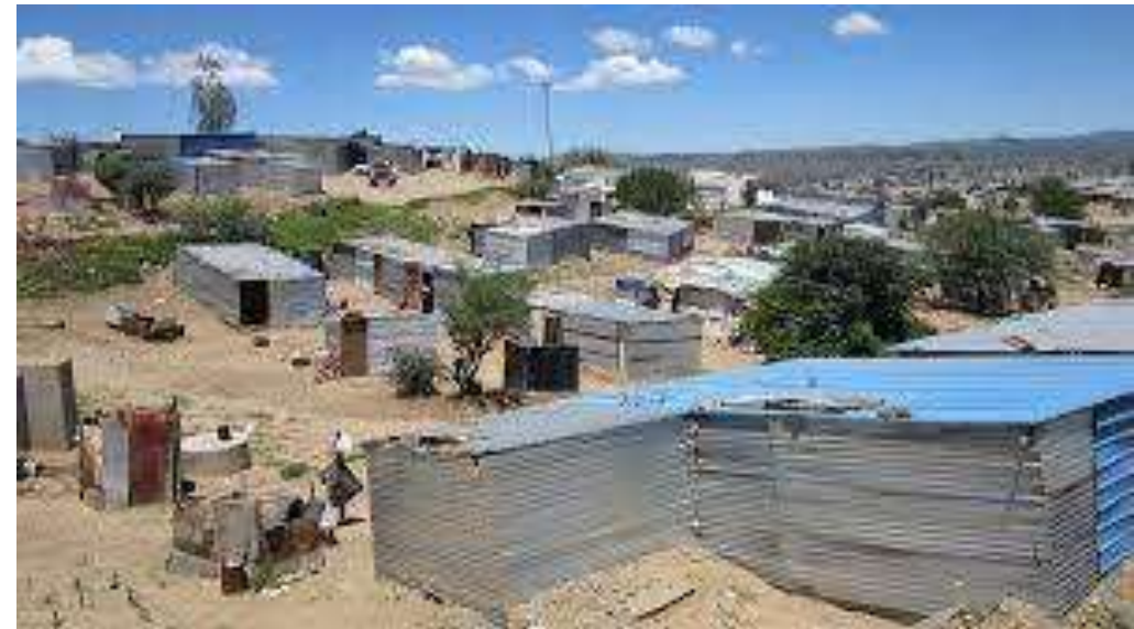
Informal Settlements in Windhoek

The Namibian government recently declared informal settlements a humanitarian crisis due to precious conditions of limited access to water, sanitation and tenure security (Republic of Namibia, 2011).