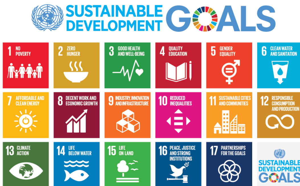
Figure 1. The 17 Sustainable Development Goals.

The UN's Sustainable Development Goals for 2030 (SDGs) place sustainable development at the top of the agenda for governments, companies and populations