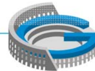
FIG Working Week 2012 Rome, Italy 6–10 May Knowing to: Manage the territory Protect the environment Evaluate the cultural heritage