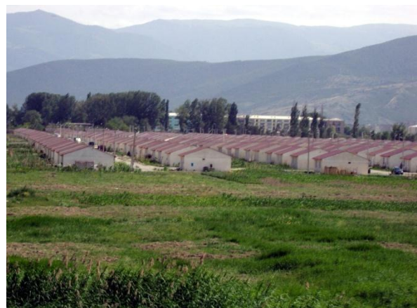
Figure 3-1 Sprawl as a planned development for IDP's Gardabani near Gori, Georgia.