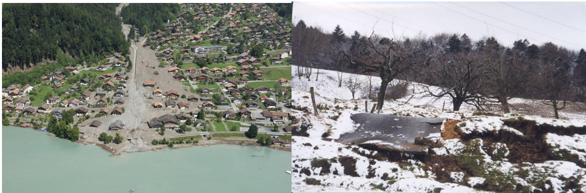
Figure 4-1 Debris flow in the Bernese Alps, municipality of Brienz (2005, left), Switzerland and landslide in the eastern Jura Mountains, municipality of Wintersingen near Basel, Switzerland (1999, right).

Direction is successful especially if there is danger to be avoided by risk based land use planning measures. Hazardous areas such as floodplains, mud and snow slide areas etc. (Figure 4-1) are not feasible conditions for housing (Kohli, A. 1999). Even belated identification