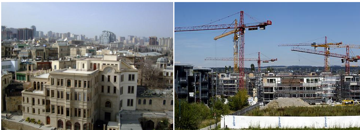
Figure 2-1 Construction hype in Azerbaijan (2008, left) and Switzerland (2007, right).

As a basic rule it must be accepted that economic growth leads to the demand for land. This happens in agricultural-based as well as industrial economies. By 2009 economic growth in Switzerland resulted in one square metre of land (agricultural ~) being consumed by streets and buildings every second (Figure 2-1). With a well defined and permanently monitored land use planning system in place the consumption of land could not be hampered. Several towns had to integrate formerly independent villages as suburbs. Equal results can be found in the megacity of Baku, Azerbaijan. There development combined with migration from the land produced a phenomenal construction boom (Figure 2-1).