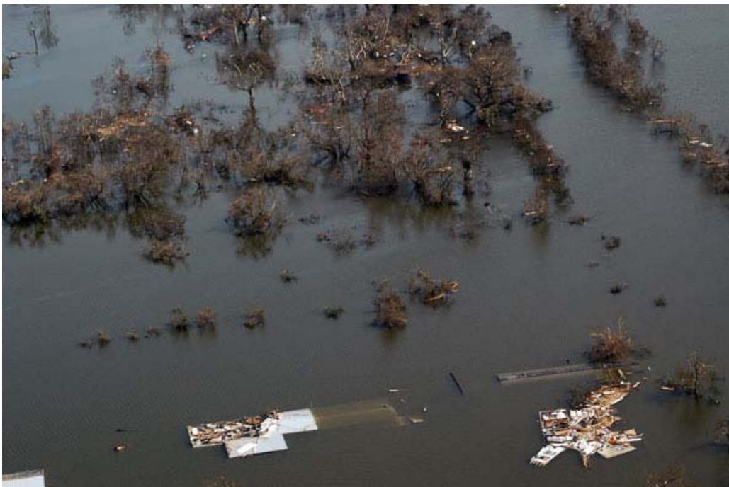
Hurricane Katrina in Venice, Louisiana in 2005

When Hurricane Katrina struck the Mexico Gulf Coast, critical parcel information that was urgently needed by emergency responders, public officials, and insurance companies was not readily available and, in many cases, was nonexistent.(National Research Council, 2007)