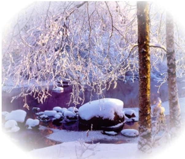
FIG Office wishes you:

Welcome to the FIG e-Newsletter, which brings you latest information about FIG and its activities. The information referred here is in full length available on the FIG web site. Thus the e-Newsletter is produced to inform you what has happened recently and what interesting things are going to take place in the near future. The FIG e-Newsletter is circulated monthly or bi-monthly by e-mail. The referred articles are in English and written in a way that you are able to extract them to your national newsletters or circulate to your members and networks.