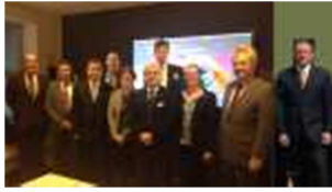
FIG Commission 4 cooperates with other organisations that focus on various aspects on hydrography and hydrographic surveying. A series of meetings has been formed to undertake simple and informal meetings to help coordination and exchange of information and experience on the Capacity Building within the area and to attract young people to working in the nautic area.

www.fig.net/news/news_2014/2014_11_capacity_building_hydro.htm