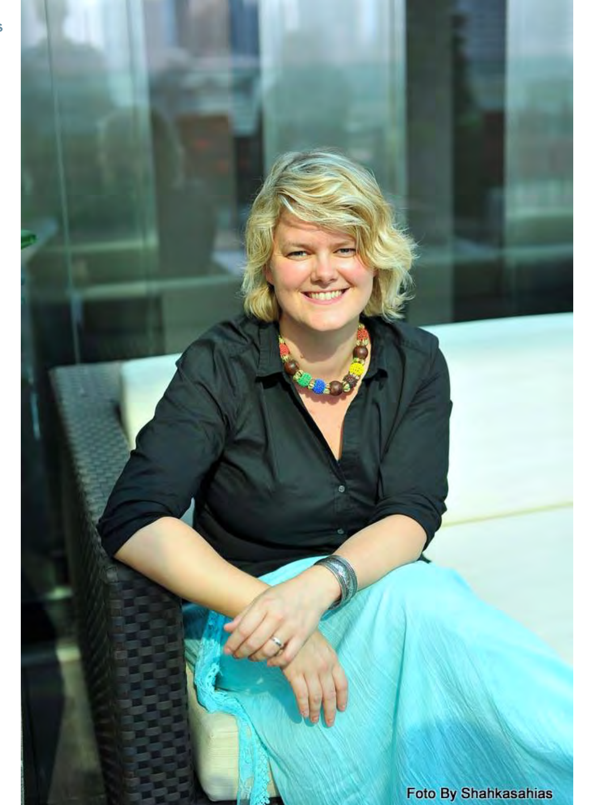
FIG Young Surveyors Network Vice-Chair of Administration