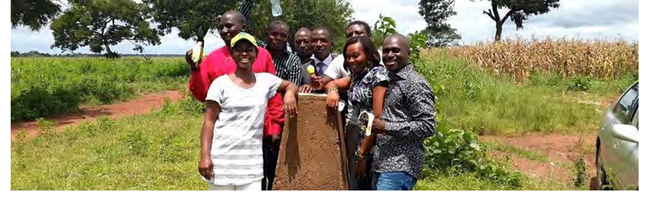
"If you want to walk fast, walk alone. If you want to walk far, walk with others." — African Proverb