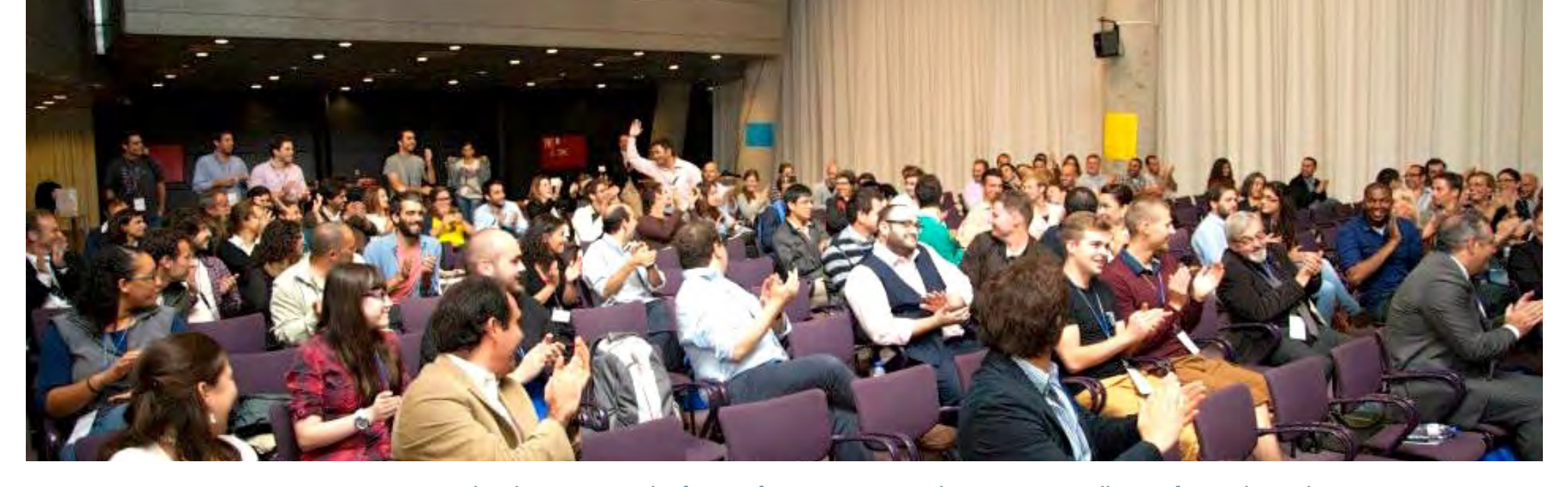
"It is young people who represent the future of our economy and society. Our collective future depends on young people's skills, ideas and abilities, and on whether they get an opportunity to apply and develop them in the labour market. Investing in young people is therefore a moral imperative, a social necessity and simple economic sense." — László ANDOR (EU Commission)