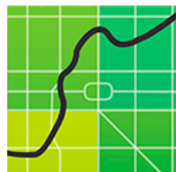
FIG Working Week 2016