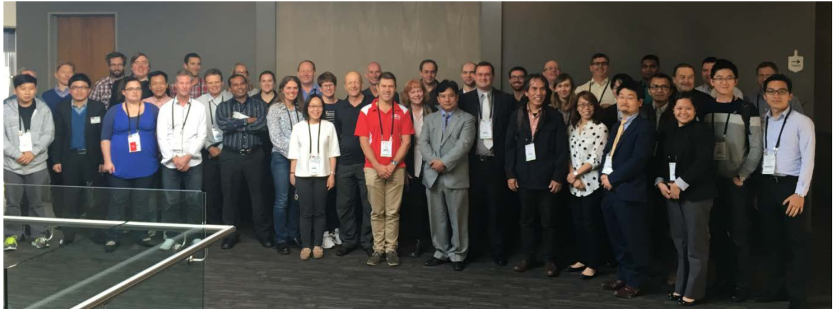
Group photo of attendees