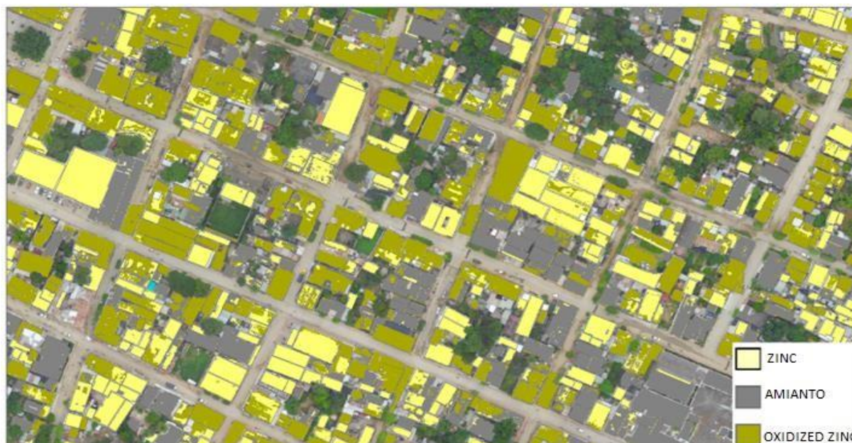
Figure 5. Classification Processing 1.

The models on the processed images achieved an accuracy of 0.85 on the test set. The best performance was achieved with processing procedure 2, obtaining a superior F1 Score