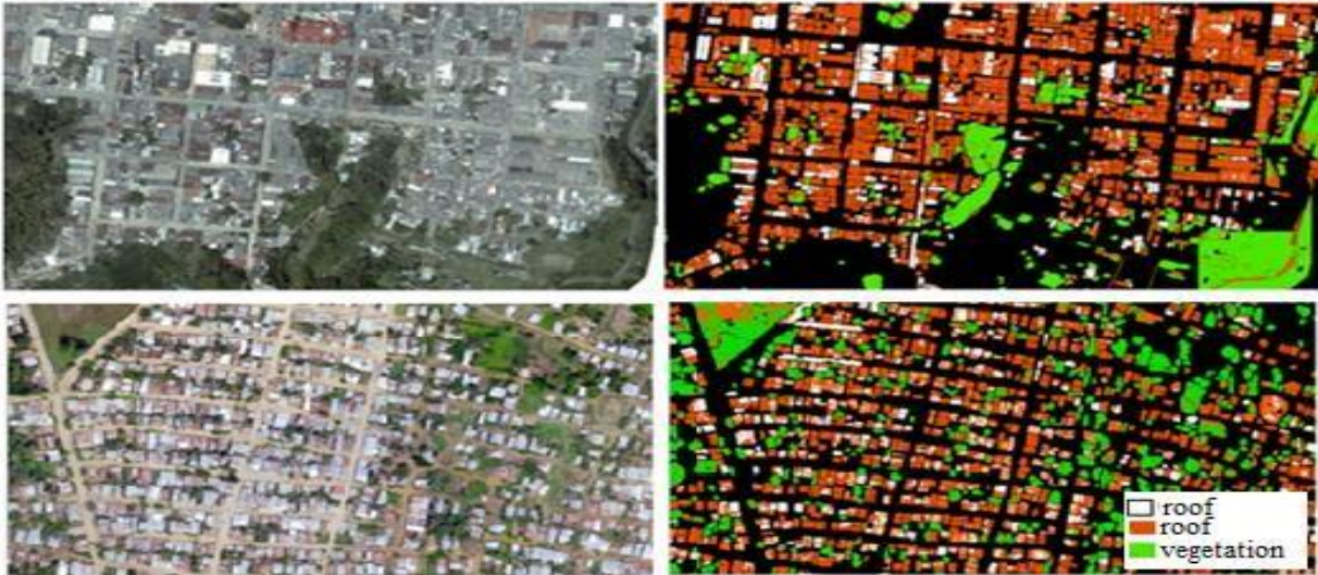
Figure 1. Sample results of the cluster for Quimbaya (above) and Carmen de Bolívar (below).

In San Andrés (Illustration 4), the classification showed confusion between the roofs and vegetation. Consequently, random forest was applied to the polygons of interest with various categories. In this context, green pixels were designated to represent vegetation, while other colors represented different types of roofs. The application of this classification in the image provided satisfactory visual results. Subsequently, the vegetation was cleaned based on this classification.