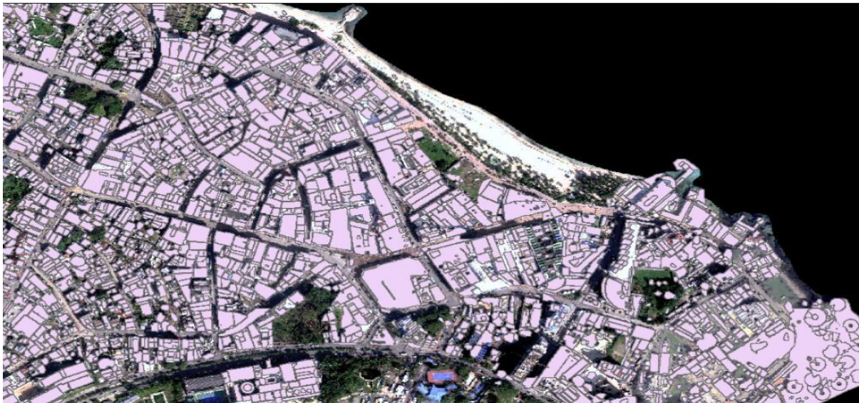
Figure 2. SAM Segmentation in San Andrés.

For the segmentation of images from the three municipalities under study, the SAM was utilized. SAM is a model developed by Meta AI designed to address object segmentation tasks in images and videos (Kirillov, Mintun, Ravi, Mao, & Rollan, 2023). It is known for its adaptability and application to various segmentation problems in fields as diverse as computer vision, medical image segmentation, and remote sensing. In a recent analysis (Wu & Prado, 2023), the capabilities of SAM for processing remote sensing images using aerial and satellite data were demonstrated, leading to the development of a new package called SAMgeo. The results concluded that SAM performs exceptionally well in remote sensing segmentation tasks. The implementation proceeded, and in Illustration 2, an image of the segmentation of San Andrés is observed.