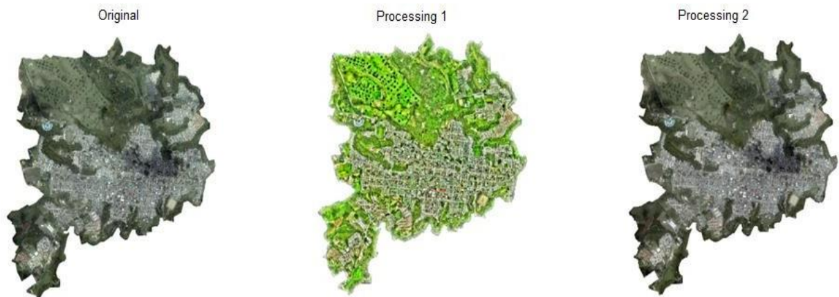
Figure 7. Processed images of Quimbaya.