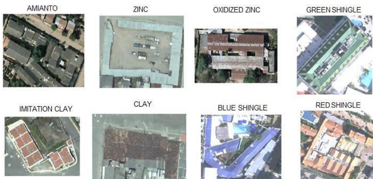
Figure 4. Roof Materials.

The labeling of the roofs was done manually on the digital orthoimages, under the supervision of expert evaluators from IGAC. In this process, a representative sample of polygons was labeled. For the municipality of Carmen de Bolívar, the labeling was done with a field visit, allowing the verification of the assigned labels in the office. The following is the list of labeled polygons by municipality. (Table 2)