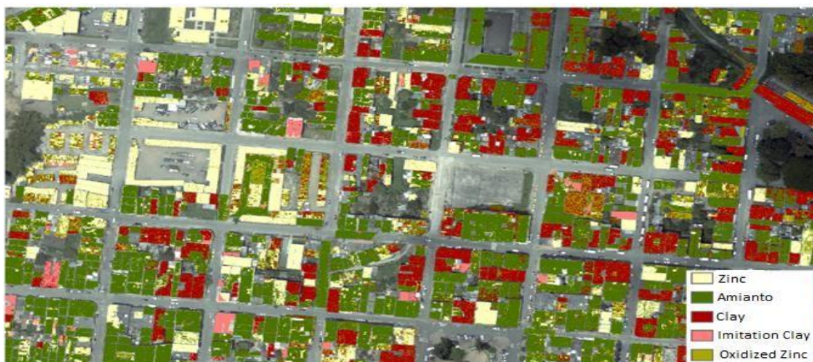
Figure 8. Classification Processing 2.

The trained model shows improvements with image processing 1 and 2. The most notable performance was achieved with processing 2, obtaining an accuracy of 0.80 in the test set. The recall for most categories is above 0.70 (Table 3). The best precision was achieved in amianto, clay, and zinc roofs, while imitation clay and oxidized zinc had the lowest metrics. From Table 4, it can be observed that the imitation clay class faces difficulties with several instances misassigned to other classes, such as clay and rusted zinc. This suggests, on one hand, that imitation clay may have spectral (color) and pattern characteristics that resemble other roofs materials, mainly clay. On the other hand, although a high number of oxidized zinc is correctly classified, there are some confusions, especially with clay and amianto. This could be attributable to shared spectral patterns among these materials.