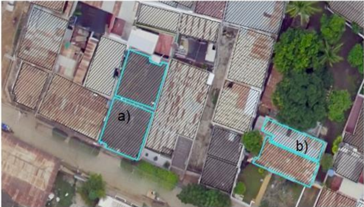
Figure 3. Examples of divided roof into multiple polygons: A). Hipped roofs and, B). Multiple materials.

in some cases of SAM to identify two or more water roofs as a single unit, and ii) the presence of roofs with two types of materials or in different states of conservation, such as oxidized zinc and zinc. See Illustration 5.