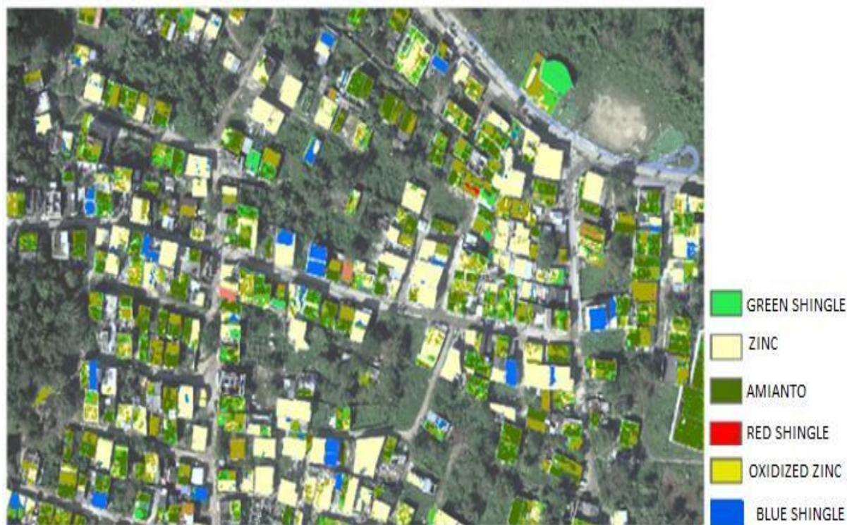
Figure 9. Classification Processing 2.

Although the models show an overall acceptable accuracy, precision, and recall exhibit high variability. Amianto, shingle, and zinc are the roofing materials that demonstrate higher precision in identification, with precision values exceeding 0.9 in these cases. The other materials (green and red shingle, and oxidized zinc) exhibit confusion levels with precision below 0.3. These three materials are especially confused with amianto, which may be attributed to the significant influence of the radiometric quality of the source image on the model's performance. Therefore, the importance of having inputs with good spectral quality is emphasized, and the need for complementary field validation work is stressed to assess the external quality of the model results.